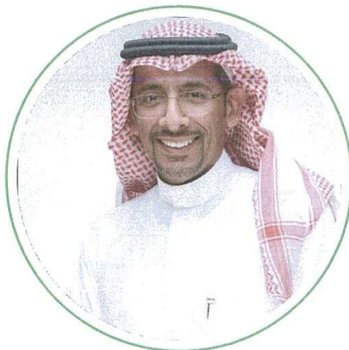
His Excellency Mr. Bandar bin Ibrahim Al-Khorayef Minister of Industry and Mineral Resources

We must keep pace with the current and rapid changes in the world and exploit the opportunities presented by existing global industrial progress to compete globally.