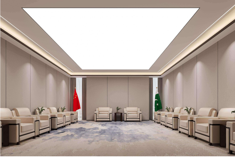
VIP Reception Hall