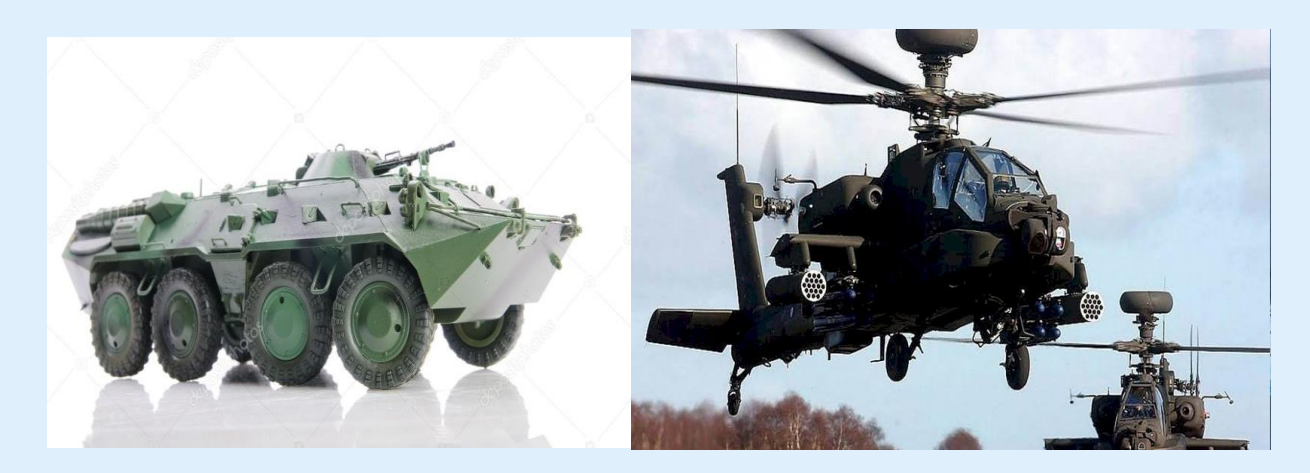
Project supplying and Automation engineering for defense: