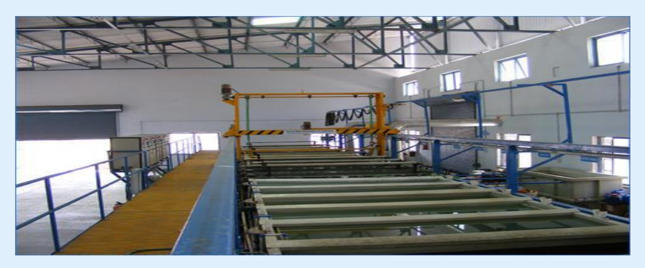
**We have experienced project management team for supporting EPC contractor for defense sect