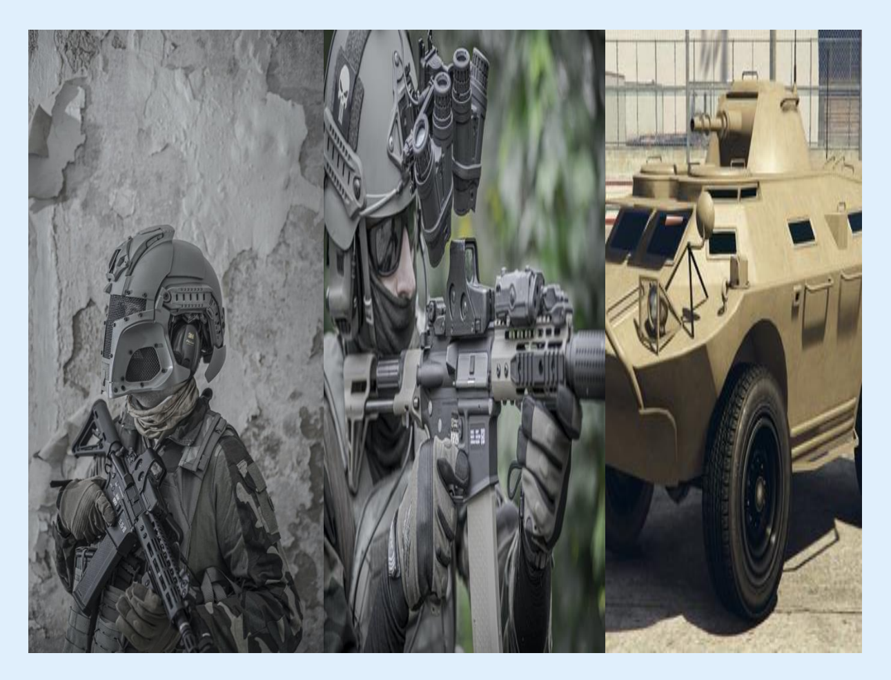
Auto Corner – Supplying Solution Support.