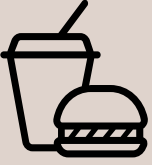
Food & Beverages

Halal Trade, Logistics and Manufacturing Expo will further strengthen Africa's position as a global halal hub and put forward the economic values of Halal for the world.